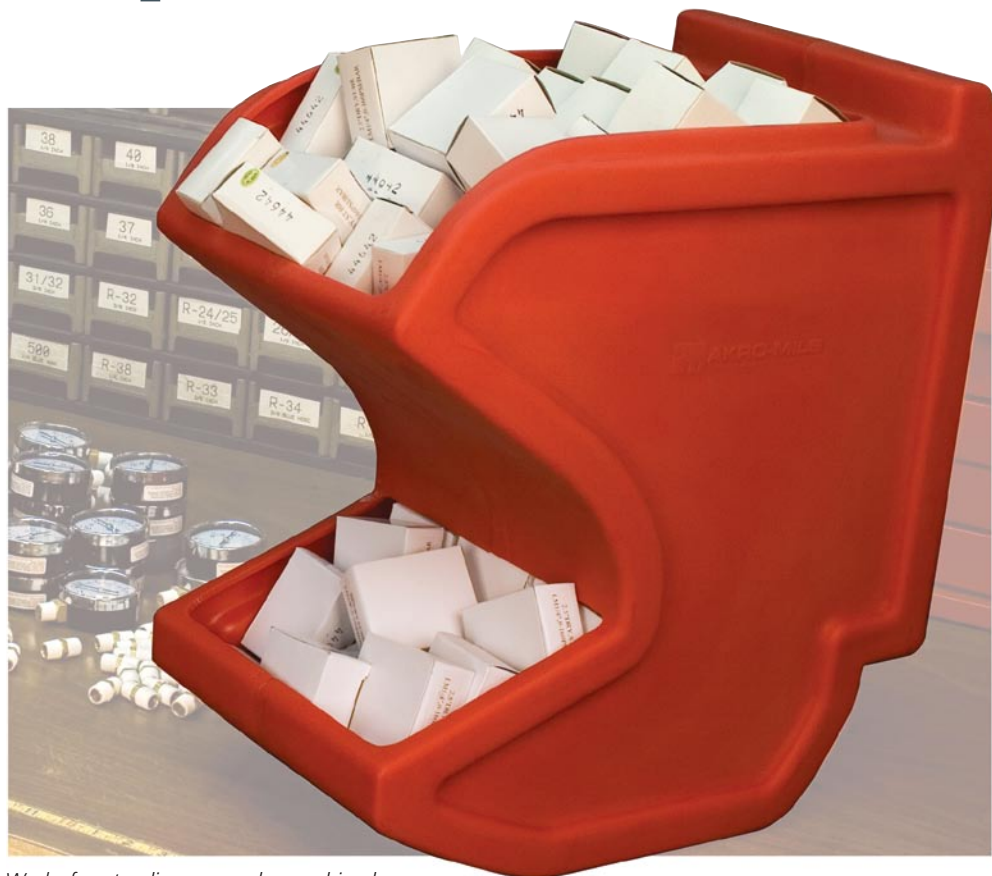
Works freestanding, or can be combined with the optional rack to create work cells or KANBAN stations