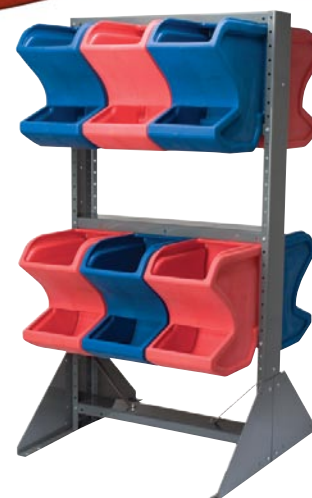
31625RACK holds 6 Easy Flow Gravity Hoppers per side for maximum efficiency

Specify color when ordering: Red or Blue