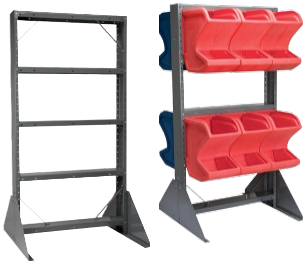
Double-Sided Gravity Hopper Rack Unit Model No. 31625RACK